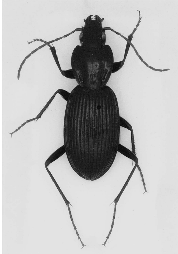
Fig. 1. Synuchus (Synuchus) masumotoi MORITA, sp. nov.

weakly curved along the eyes, and becoming shallower posteriad; posterior supraorbital pore situated a little behind the post eye level; microsculpture consisting of isodiametric meshes on frons, and of wide to transverse meshes on neck; genae variable in size, but always well convex; GL/eL 0.45, 0.65 in 2 ♀♀; mentum tooth rather wide and weakly bifid at the tip; apex of labrum weakly emarginate; terminal segment of labial palpus cylindrical and widest at about middle (not dilated); terminal segment of maxillary palpus widest at about middle; antennal segment 2 with a long seta; relative lengths of antennal segments as follows:— I : II : III : IV : V : VI : XI \approx 1 : 0.59 : 1.25 : 1.33 : 1.39 : 1.37 : 1.23 in ♂, \approx 1 : 0.55 : 1.20 : 1.25 : 1.26 : 1.22 : 1.14 in ♀.